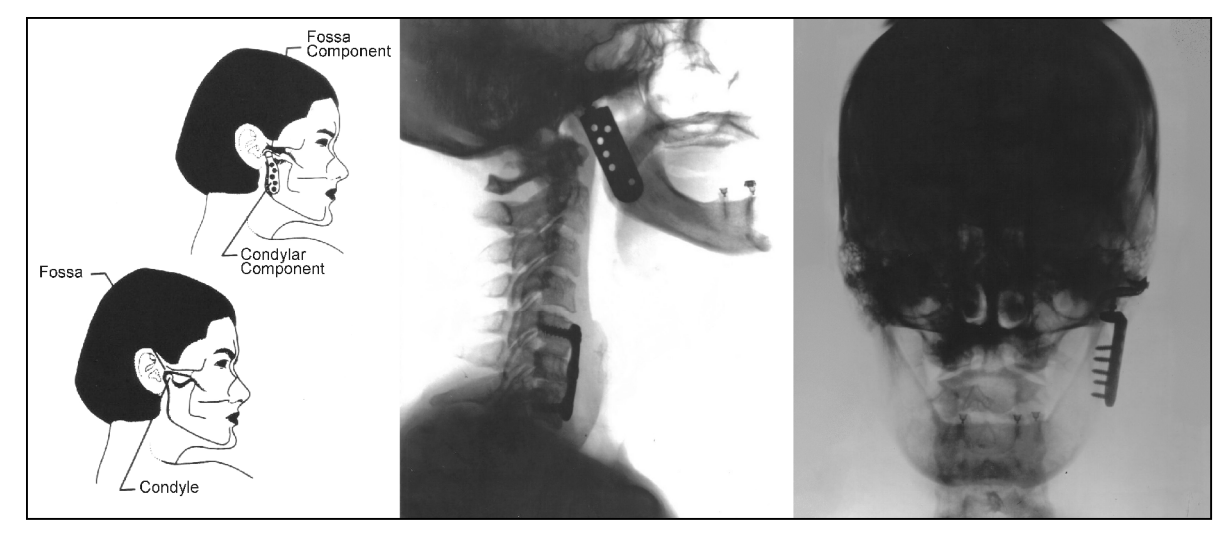
Figure 1: Schematic of Typical Total TMJ Implant